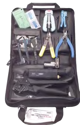
Universal No-epoxy/No-polish Termination Kit