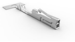
NanoMQS Applied Connector