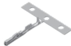
Receptacle Part number: CAT-D9932-M6641B