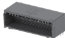
Connector Assembly Part number: 1-2372488-7 Receptacle 1871303-1