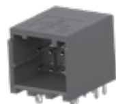
PCB Mount Header Part number: 1-2348455-4