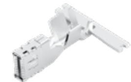
Housing Receptacle Part number: CAT-D9932-A88B