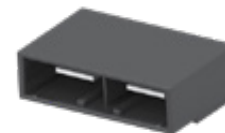
Receptacle Part number: 1-2351965-2