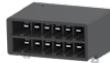
PCB Mount Header Part number: 1-316081-2