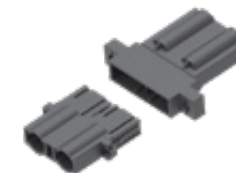
Housing Receptacle Part number: CAT-D9932-A88