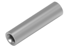
SOLISTRAND Splice Part Number: 330367