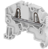
ENTRELEC PI-Spring Terminal Blocks