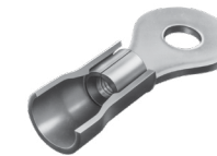
SOLISTRAND Terminal (Ring Tongue) Part Number: 33461