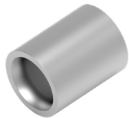
SOLISTRAND Splice Part Number: 34318