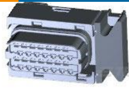
TE Part #1393436-4 V23542C1028B300=KABELBAUMST. 8