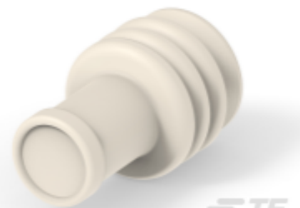
TE Part #1393457-5 V23540M1000Z119=BLINDSTOPFEN (