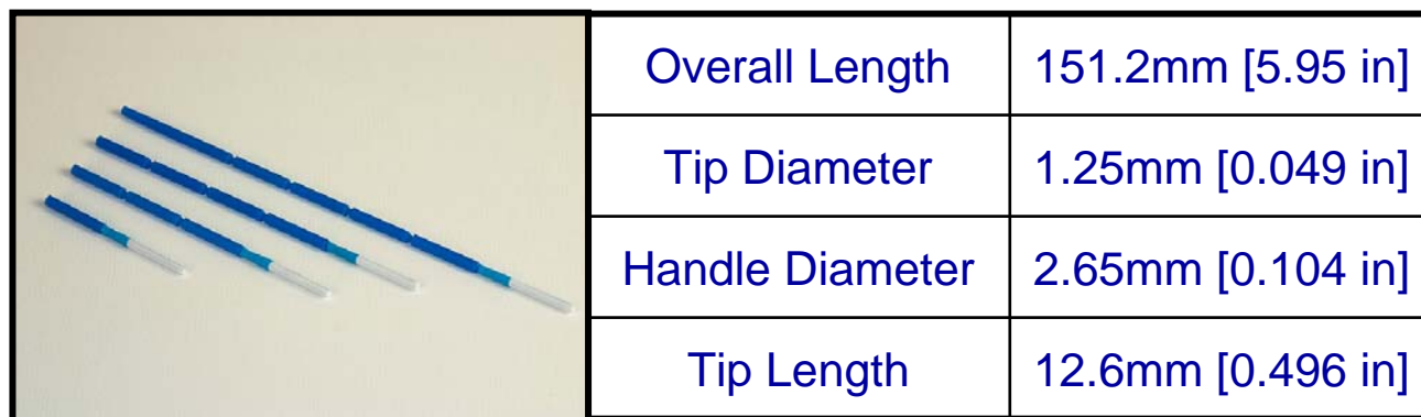
1918807-1 2.5mm stick cleaner