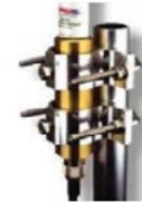
FM2 Mounting Kit (Sold separately)