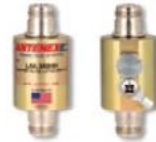
Lightning Arrestor LABH350NN (Sold Separately)