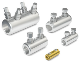
Including our new BSLU and BSLB mechanical shear bolt connectors