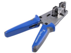
STRIPPING TOOL SOLARLOK 4-1579002-2