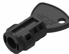
SAFE-TE MALE 2396108-1