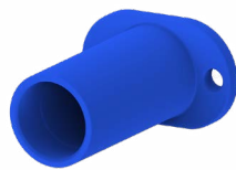
DUST CAP FOR FEMALE HOUSING 2232227-1