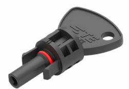
SAFE-TE FEMALE 2396109-1