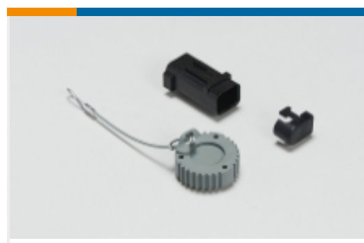
Automotive Connector Caps &amp; Covers (2)