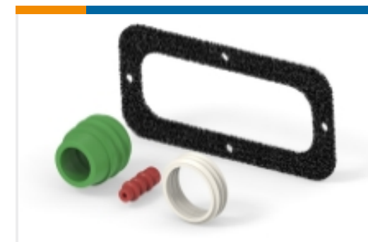
Connector Seals & Cavity Plugs(7)