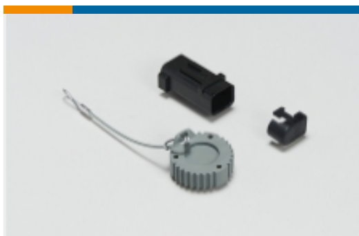
Automotive Connector Caps & Covers (2)