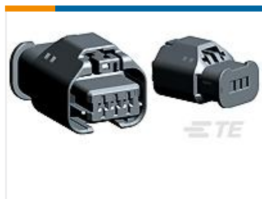
TE Part #1801178-1 3W RECEPTACLE HP CONNECTOR BLACK