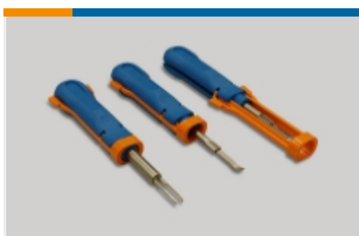
Insertion & Extraction Tools(13)