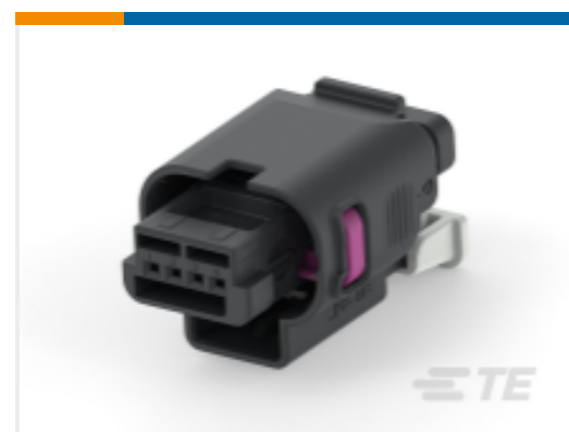
TE Part #1801823-1 4POS,MCON 0.5 CB,REC HSG,BLACK, ASSY,SLD