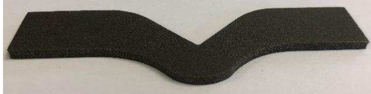
Figure 2: A standard sample of ECE material cut in preparation for Tear Strength Testing.

Five 90° bent samples (Die C) are cut from standard moulded sheet stock of the appropriate ECE material at a nominal thickness of 2.0mm.