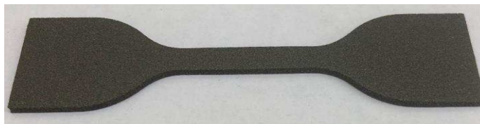
Figure 1: A standard sample of ECE material cut in preparation for Tensile Strength & Elongation Testing.

Five dumbbells shaped (Die C) samples are cut from standard moulded sheet stock of the appropriate ECE material at a nominal thickness of 2.0mm.