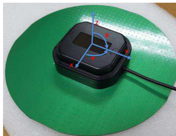
Figure 2 - Mounted PCB for V.S.W.R test