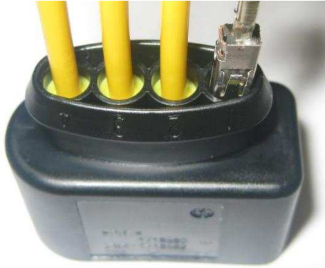
Figure 1: Contact insertion: