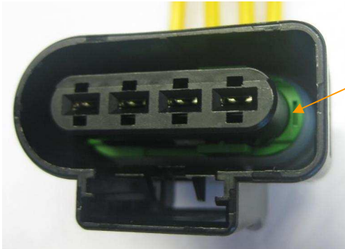
Figure 2: Retainer closed: (shifting length: 3.0mm)