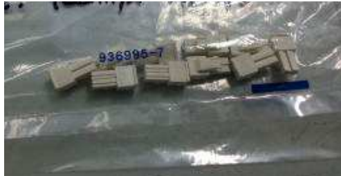
Plug Housing (Fig.1)

TP-14-00698 consist of each 10pcs Plug Housing samples and Cap housing samples for SI No. 1, 2. See Fig 1, Fig 2.