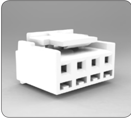
EP II 4-Posn Retainer Housing with Latch and Tabs, part number 2132781-4