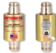
Lightning Arrester LABH350NN (Sold Separately)