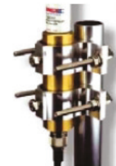
FM2 Mounting Kit (Sold separately)