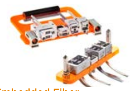
Embedded Fiber Protection Solutions