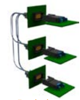
Flex on Backplane Connector Solutions