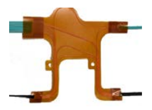
Extensive Optical Shuffle Solutions