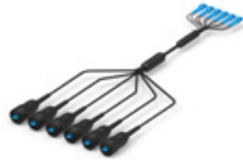
Fiber Optic Single Mode (FOSM) 2F FullAXS LC - LC Duplex