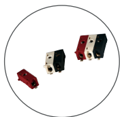
BUCHANAN WIREMATE MODULAR/RELEASABLE SMT POKE-IN CONNECTORS