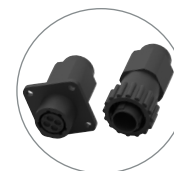
SEALED, UV-STABLE CPC CABLE-TO-PANEL