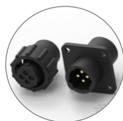
UV CPC CABLE TO PANEL