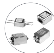
Corcom POWER FILTERS