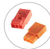
LIGHT-N-LOK UL2459 BALLAST/DRIVER DISCONNECTS