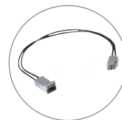
MINI SLIMSEAL WIRE-TO-WIRE