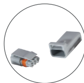
MINI SLIMSEAL WIRE-TO-BOARD