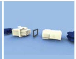
Wire Seal Configuration