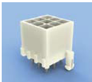
Vertical Pin Header