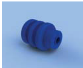
Single Wire Seal