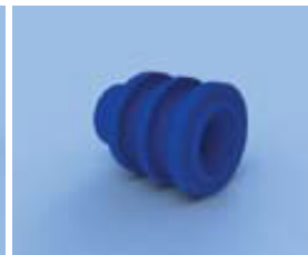
Single Wire Seal