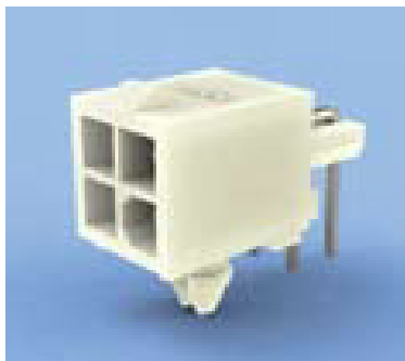
Right Angle Pin Header