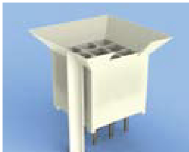
Vertical PC Board Pin Header