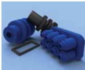
Single & Gang Wire Seals with Interfacial Seal