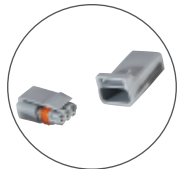
MINI SLIMSEAL WIRE-TO-BOARD