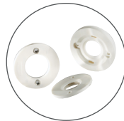
LUMAWISE LED HOLDERS