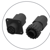
SEALED, UV-STABLE CPC CABLE-TO-PANEL