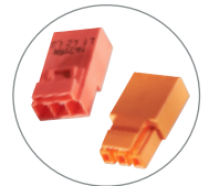
LIGHT-N-LOK UL2459 BALLAST/DRIVER DISCONNECTS