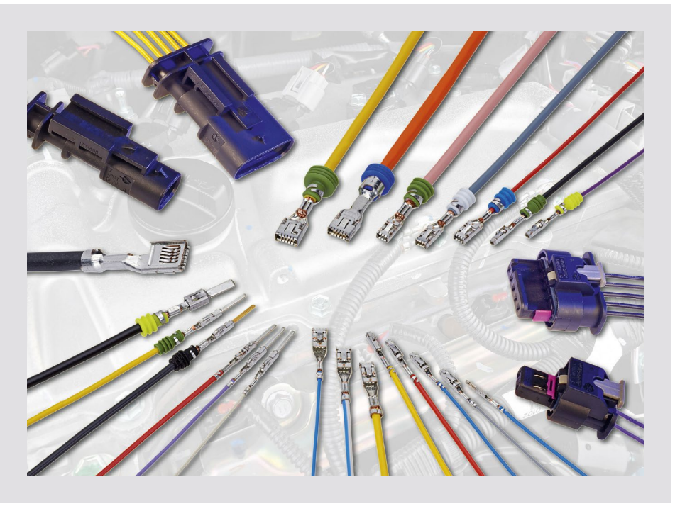
Fig. 1 MCON contact family

The success of the MCON 1.2 version, for instance, is due to the long-term safety of its electrical connections. In this receptacle contact, each of the four independent lamellar contact springs in the polarized contact establishes two contact points to the tab contact, so that eight electrical contact points are